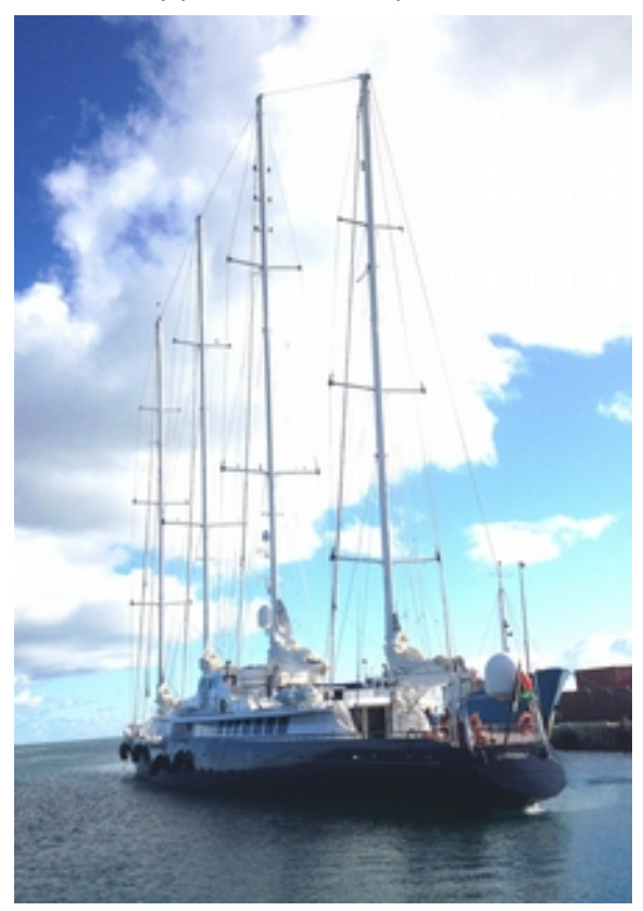
Phocea was under arrest in Vanuatu for a year, then was damaged en route to Thailand

I think each chapter of my life has had its own achievements. In modeling I'm proud of my contracts with Versace and shoots for "Vogue." I'm very proud of my good grades and determination to succeed in life. In my personal life I'm proud that I've been able to be a good daughter, sister, aunt and friend.